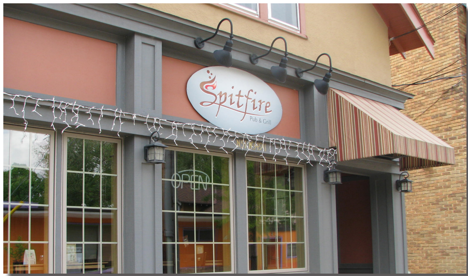
Town of Oconomowoc