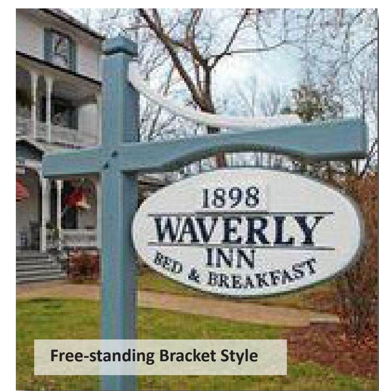
Mt. Pleasant, MI Downtown Signage Design Guidelines