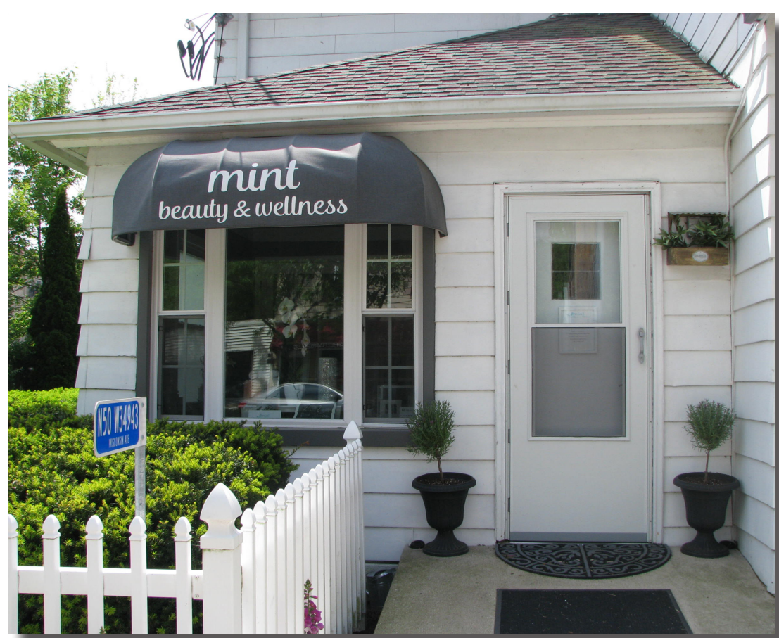
Town of Oconomowoc