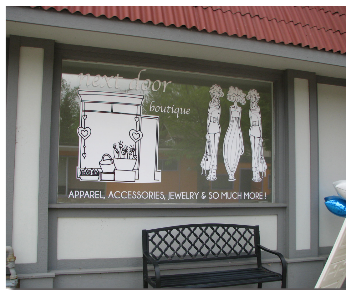
Town of Oconomowoc