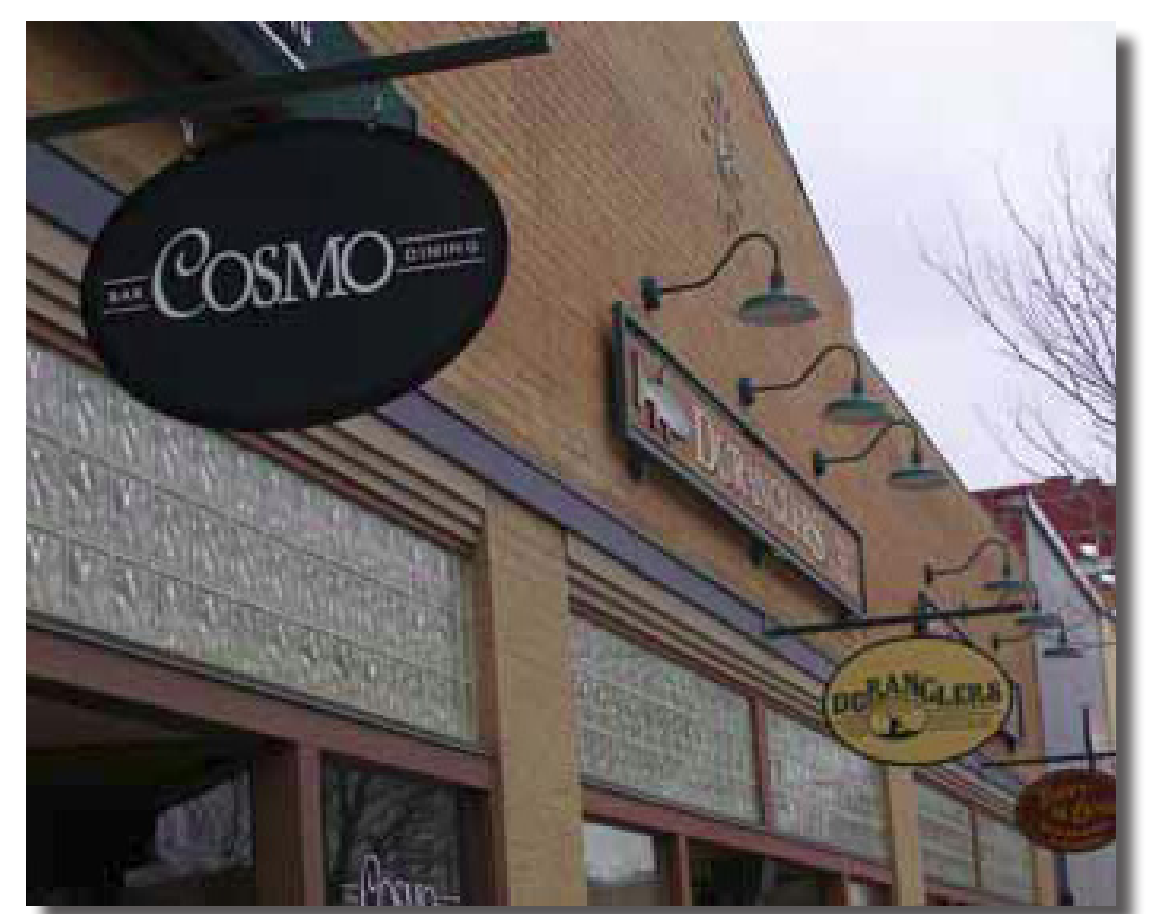
Mt. Pleasant, MI Downtown Signage Design Guidelines