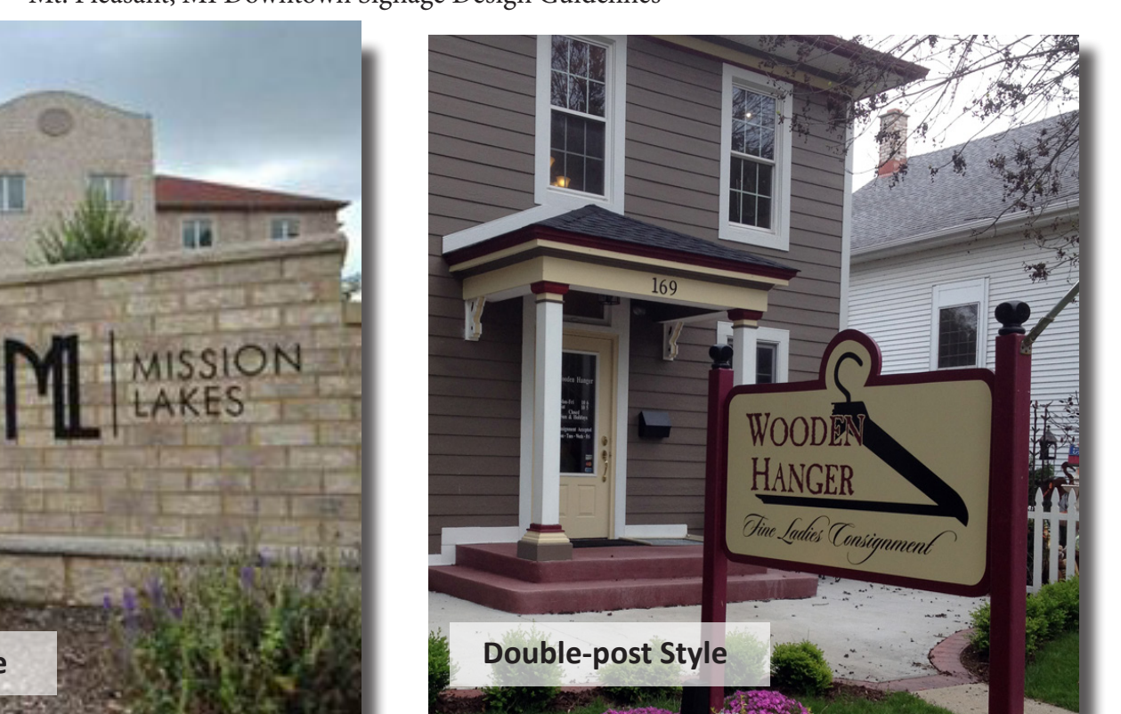
Town of Oconomowoc