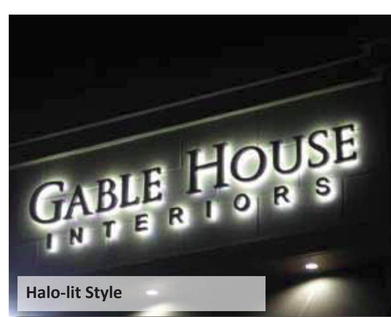
Mt. Pleasant, MI Downtown Signage Design Guidelines

No illumination is permitted after 10:00 p.m. or after closing, whichever is later.