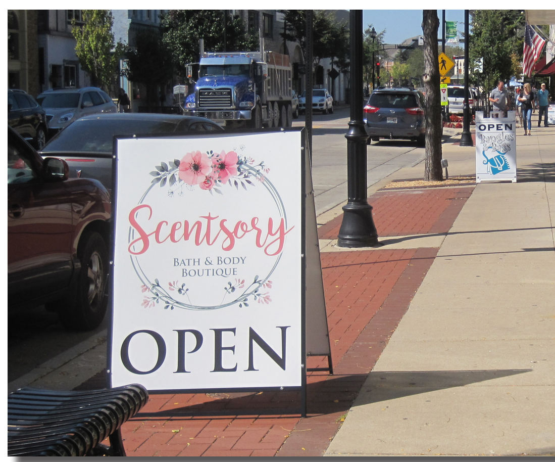
City of Oconomowoc