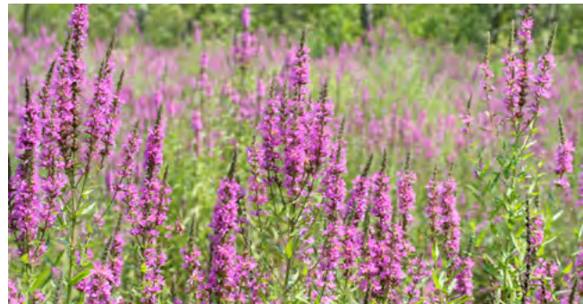
Purple Loosestrife