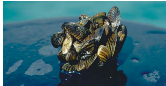
Zebra Mussel Cluster