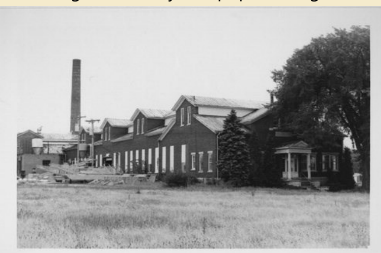
Caption: Morey Milk Condensery

The village experienced a new influx of residents in the late twentieth and early twenty-first centuries when developers built several upscale subdivisions. The population rose from 1,322 in 1990 to 2,141 in 2010. There have been mixed reactions to this growth; some residents fear that the village will lose its rural charm, and others are hopeful about its prospects for bringing more convenient business to the area. The village's land